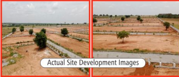
Actual Site Development Images