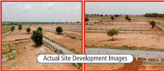
Actual Site Development Images