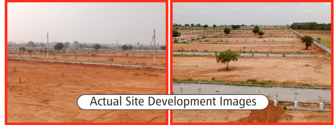
Actual Site Development Images